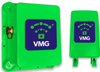
Collector and Sensor Hardware

When the Dashboard detects an alert level, it automatically sends out a message in as little as 5 minutes!